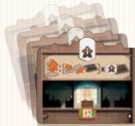
32 Department tiles (2 each of 16 different Departments)