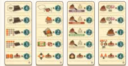
4 Donation tiles